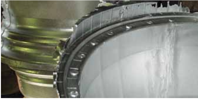
1 As-cast wheels 2 Y.MU231 operating console