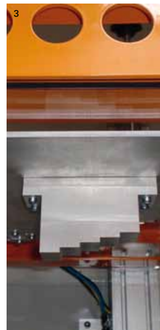
1 Y.MU231 cabinet 2 Finished wheel 3 Calibration step wedge