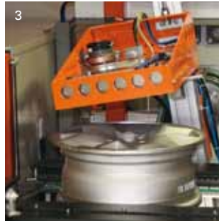
1 X-ray image of the hub 2 X-ray tube 3 Wheel and detector